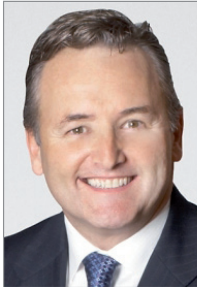
Scaysbrook: operational expertise

Scaysbrook for example was the founder of and built British energy company Novera Energy from its inception in 1997. Novera Energy was acquired by buyout group Terra Firma in 2009 and